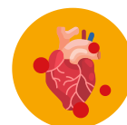
Consequential damage to the heart and blood vessels