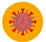
Long-term consequences of Covid-19