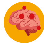
Consequential damage to the nervous system