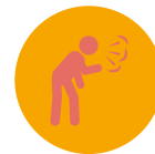
Shortness of breath up to the need for ventilation